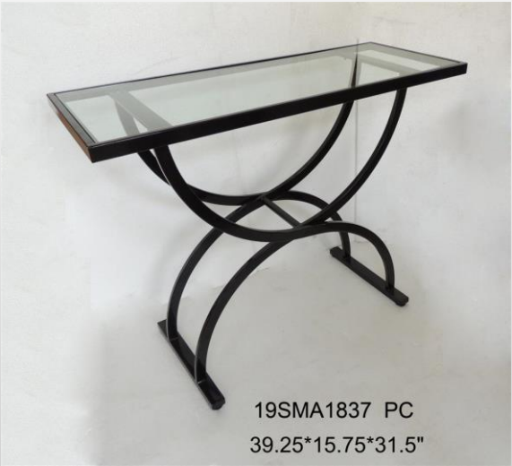
19SMA1837 PC 39.25*15.75*31.5"