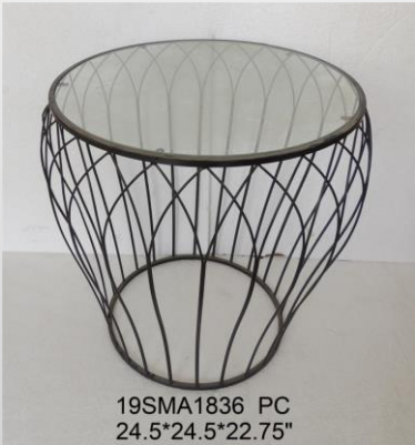
19SMA1836 PC 24.5*24.5*22.75"