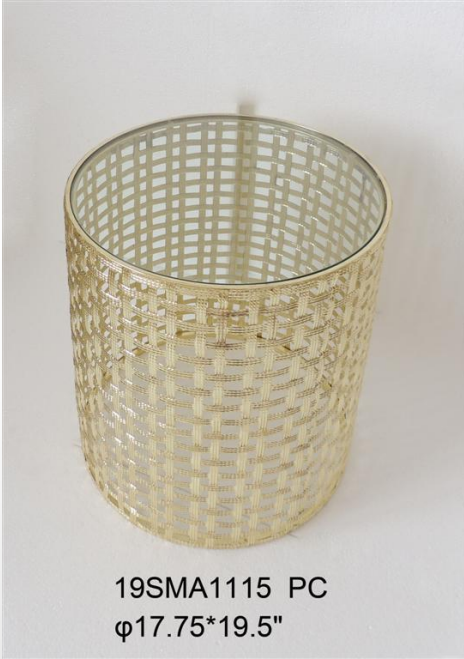
19SMA1115 PC φ17.75*19.5"