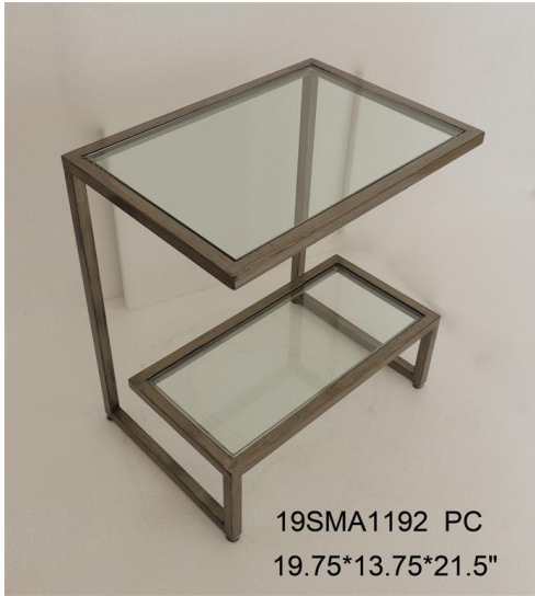
19SMA1192 PC 19.75*13.75*21.5"